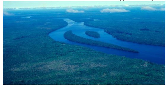
Deltas near the mouth of the Amazon

Delta: The word delta come from the 4<sup>th</sup> letter of the Greek alphabet. It looks like a triangle. When some large rivers such as the Nile or the Amazon slow down when they reach the sea, they are forced to drop thier load (the rocks, stones, mud and silt) that they are carrying and this creates a triangular shaped island or islands at the mouth of the river. These triangular shaped islands are called deltas.